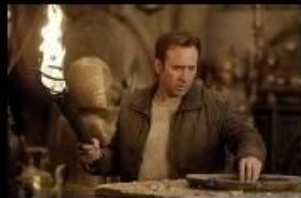
What I think I do.