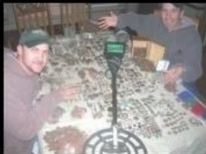
What my boss thinks I do.