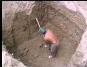
What my parents think I do.