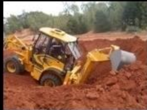
What society thinks I do.