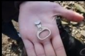
What I actually do.